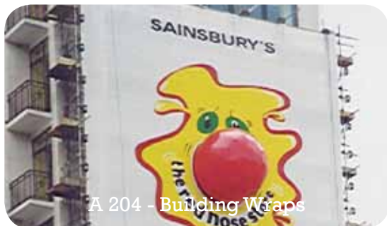
A 204 - Building Wraps