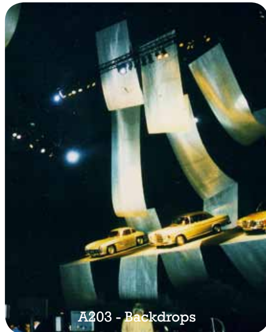
A203 - Backdrops