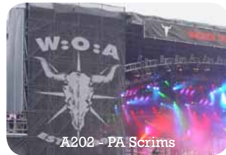
A202 - PA Scrims