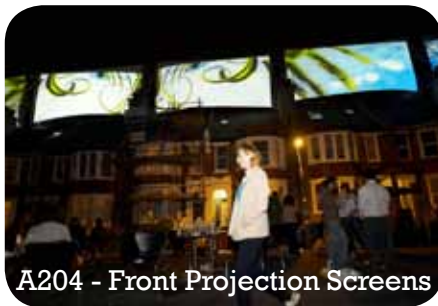
A204 - Front Projection Screens