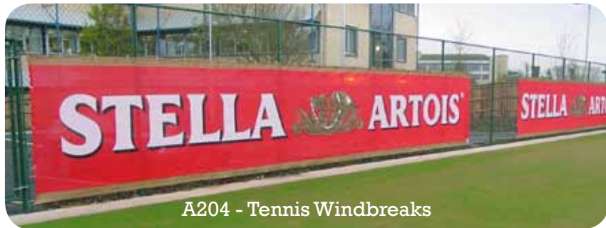
A204 - Tennis Windbreaks