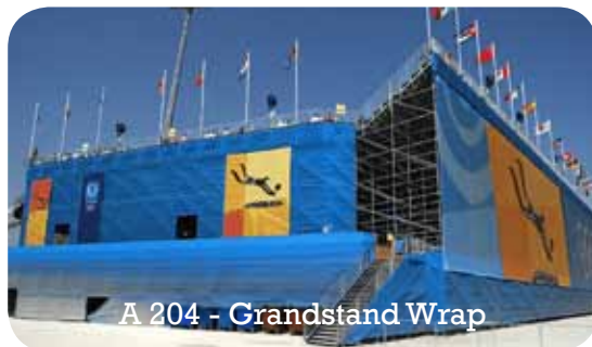
A 204 - Grandstand Wrap