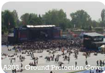
A203 - Ground Protection Cover