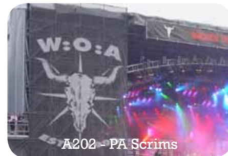
A202 - PA Scrims

head office Sunbaba House Dullingham Newmarket Suffolk CB8 9XA tel: 0044(0) 1638 507684 london office Suite 222 Legacy Business Centre Ruckholt Road Leyton London E10 5NP tel: 0044 (0) 208 988 9100 email info@sunbaba.co.uk web www.sunbaba.co.uk