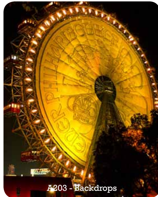
A203 - Backdrops