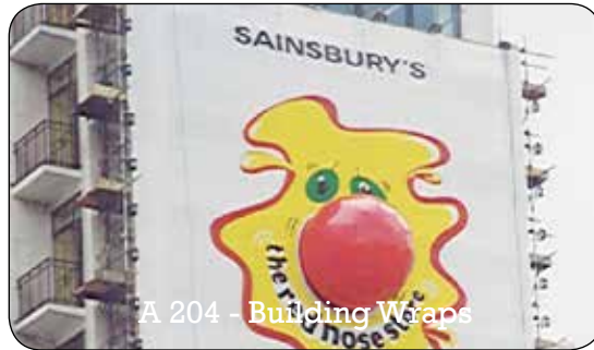
A 204 - Building Wraps