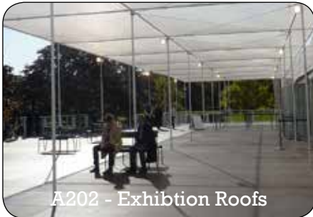
A202 - Exhibition Roofs