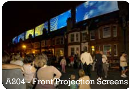
A204 - Front Projection Screens