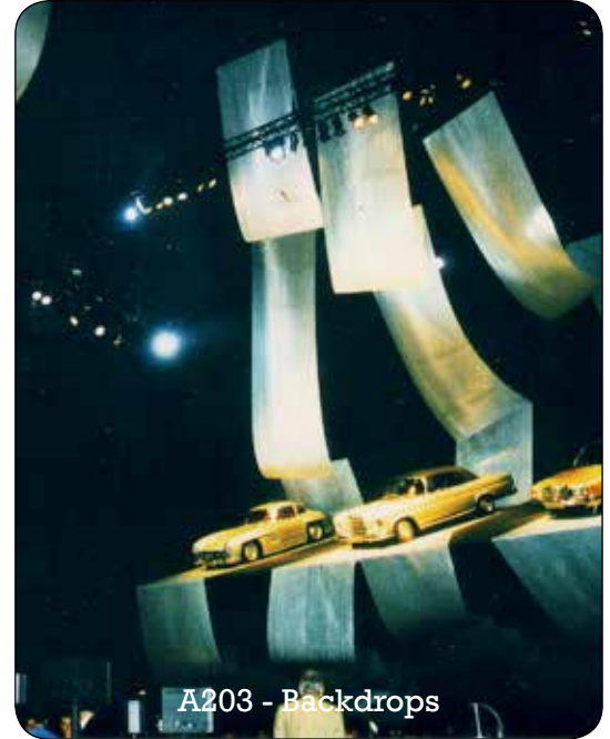
A203 - Backdrops