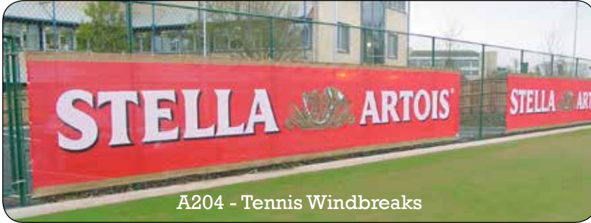
A204 - Tennis Windbreaks